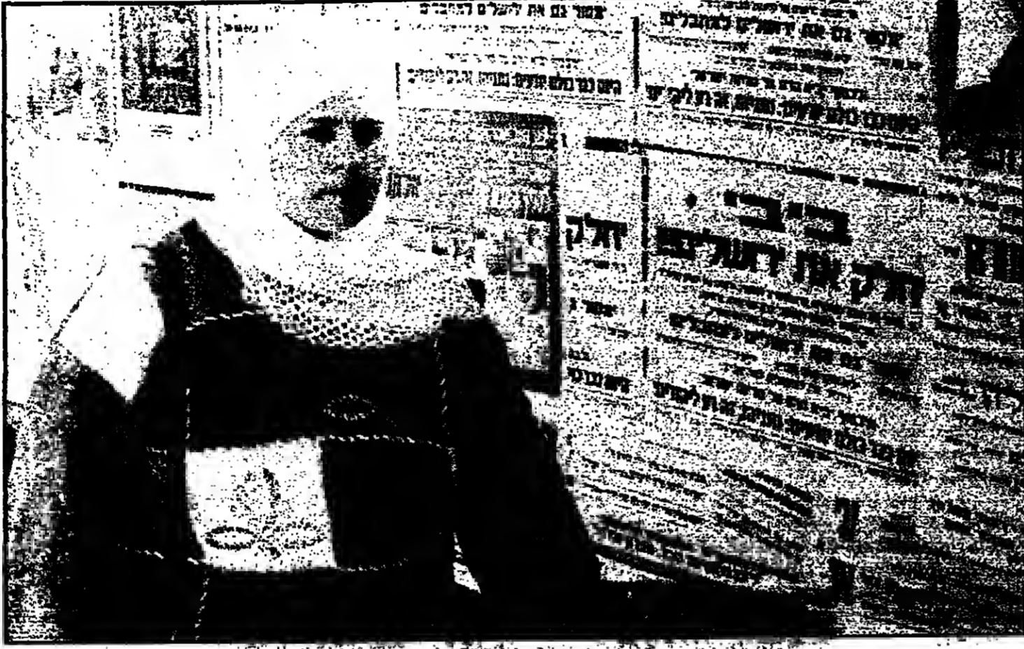
A woman walks past a Jerusalem bulletin board yesterday plastered with signs reading 'Bibi [Netanyahu] will divide Jerusalem.'

Health Minister Yehoshua Matza, however, told a meeting of